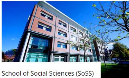
School of Social Sciences (SoSS)