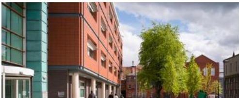
School of Environment, Education and Development (SEED)