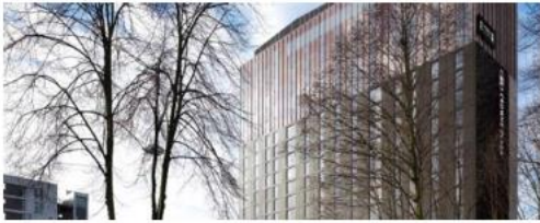
Alliance Manchester Business School (AMBS)