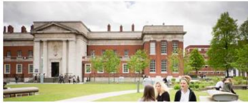
School of Arts, Languages and Cultures (SALC)